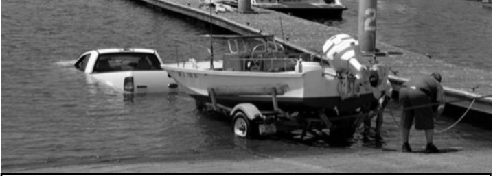
Not recommended procedure even at a perfect boat ramp!

We have asked the Town to improve conditions at the public boat ramps with more gravel, levelling, etc. In a