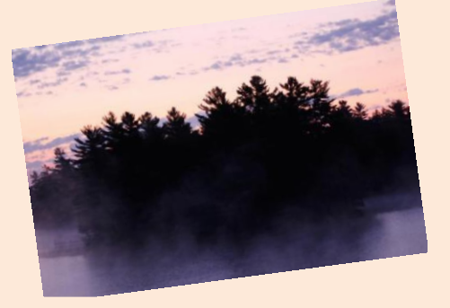
Abby (7) 5 a.m. on Kahshe