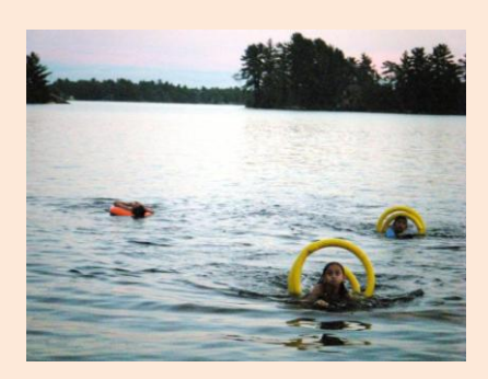
Libby (5) Cousins