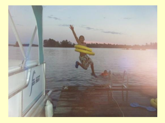
Super Graham by Libby (aged 5)